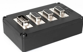
Kvaser T-Connector v2 EAN: 73-30130-00776-5