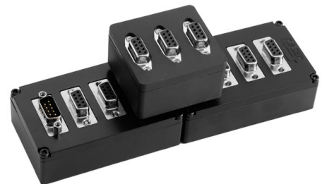
An eight D-SUB9 socket connector hub