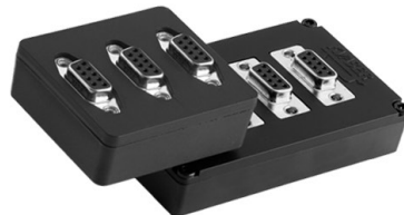
Kvaser T-Connector Expansion L EAN: 73-30130-01300-1