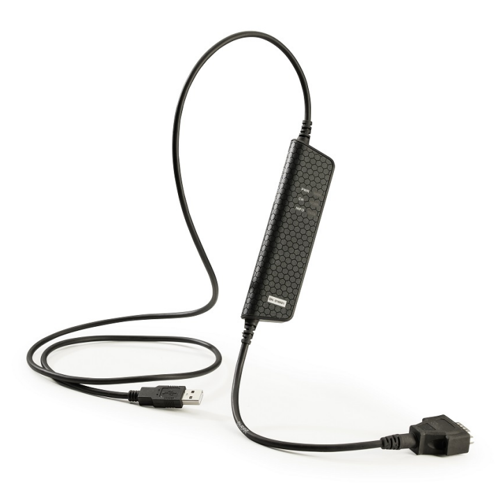
Figure 1: Kvaser Hybrid CAN/LIN

Kvaser Hybrid CAN/LIN is a single channel interface where the channel can be opened either as CAN or LIN. The Kvaser Hybrid CAN/LIN is compatible with applications that use Kvaser's CANlib and LINlib.