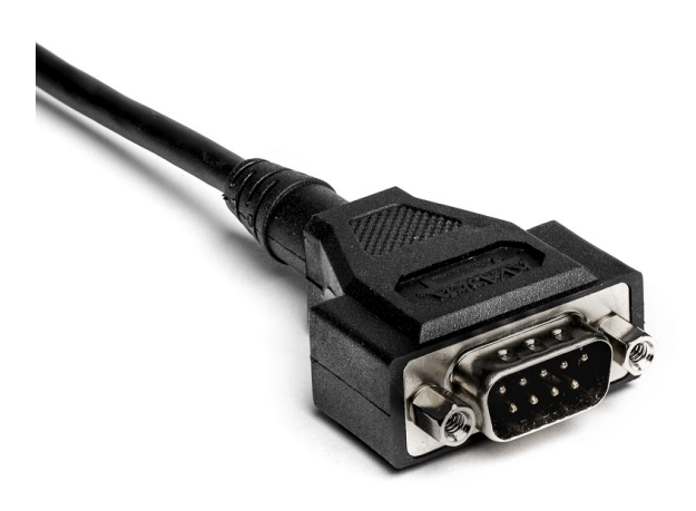
Figure 3: CAN/LIN connector on Kvaser Hybrid CAN/LIN

The Kvaser Hybrid CAN/LIN has one CAN/LIN channel in a 9-pin D-SUB CAN connector (see Figure 3). See Section 4.3, CAN/LIN connector, on Page 13 for pinout information.