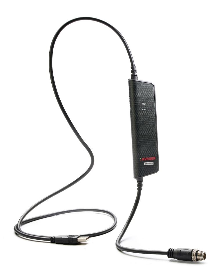
Figure 1: Kvaser Leaf v3 M12

Kvaser Leaf v3 M12 is a reliable low cost product. With a timestamp precision of 50 microseconds it handles transmission and reception of standard and extended CAN messages on the bus. It is compatible with applications that use Kvaser's CANlib.