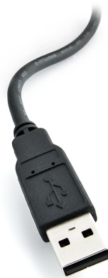
Figure 2: A standard USB type “A” connector.

The Kvaser Leaf v3 OBDII has a standard USB type “A” connector.