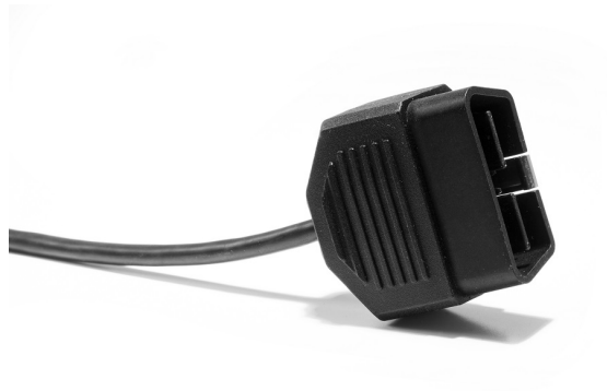
Figure 3: OBDII Type B CAN connector.