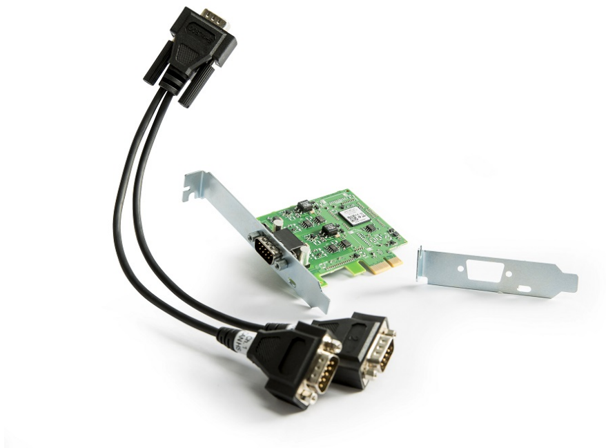
Figure 1: Kvaser PCIEcan 2xHS v2

Kvaser PCIEcan 2xHS v2 is a small, yet advanced, CAN multi-channel real time CAN interface that handles transmission and reception of standard and extended CAN messages on the bus with a high time stamp precision. The Kvaser PCIEcan 2xHS v2 is compatible with applications that use Kvaser's CANlib.