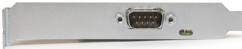
Figure 2: CAN connector on Kvaser PCIEcan 2xHS v2

The Kvaser PCIEcan 2xHS v2 has two CAN channels in a single 9-pin male D-SUB CAN connector (see Figure 2). See Section 4.2, CAN connectors, on Page 9 for pinout information.