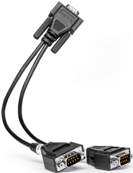
Figure 5: The DS9-2xDS9 Splitter