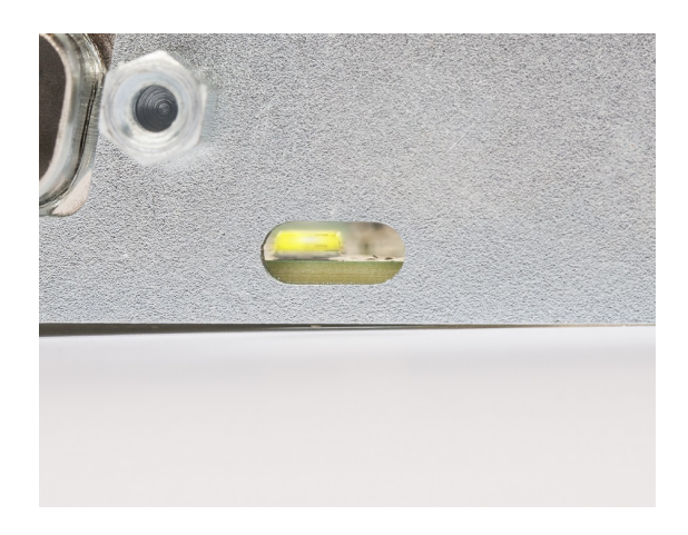
Figure 3: LED on the Kvaser PCIEcan HS v2.