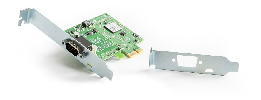
Figure 1: Kvaser PCIEcan HS v2

Kvaser PCIEcan HS v2 is a small, yet advanced, real time CAN interface that handles transmission and reception of standard and extended CAN messages on the bus with a high time stamp precision. The Kvaser PCIEcan HS v2 is compatible with applications that use Kvaser's CANlib.