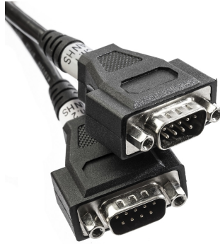
Figure 3: CAN connectors on Kvaser USBcan R v2 2xHS

The Kvaser USBcan R v2 has two CAN Hi-Speed channels with 9-pin D-SUB CAN connectors (see Figure 3 on Page 8). See Section 4.2, CAN connectors, on Page 10 for pinout information.